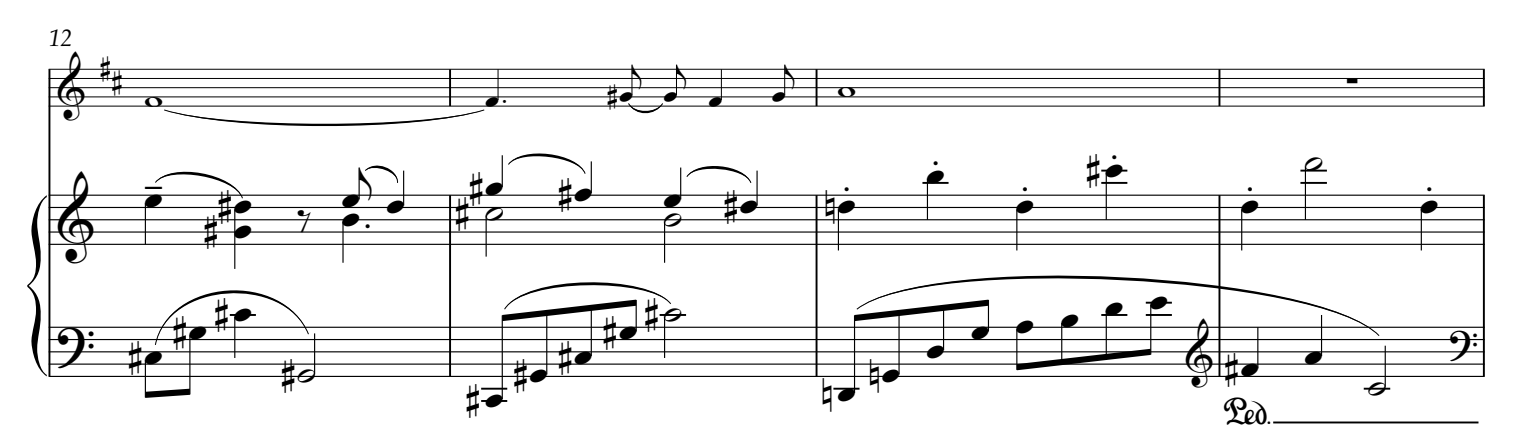
This music is copyright. Photocopying is ILLEGAL.