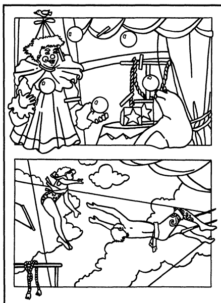
Student Coloring Book Page 10