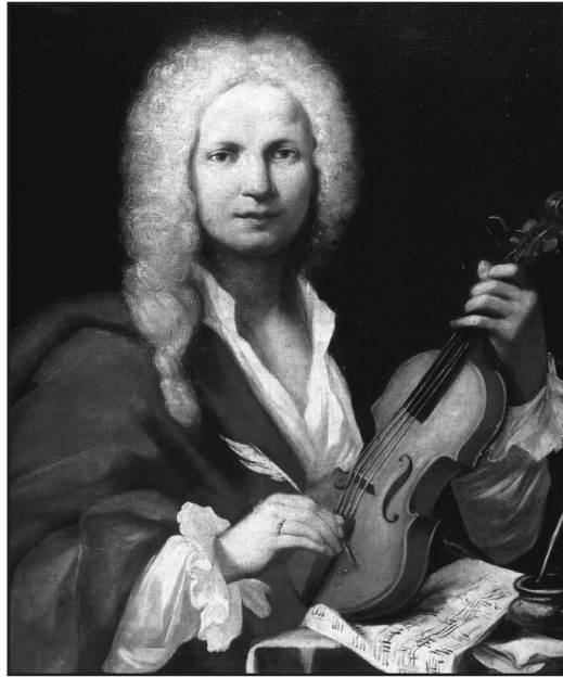
Antonio Vivaldi (1678–1741)

“Spring” was written as part of a group of four violin concerti titled The Four Seasons by Italian composer Antonio Vivaldi. Each concerto musically depicts one of the four seasons: spring, summer, autumn, and winter.