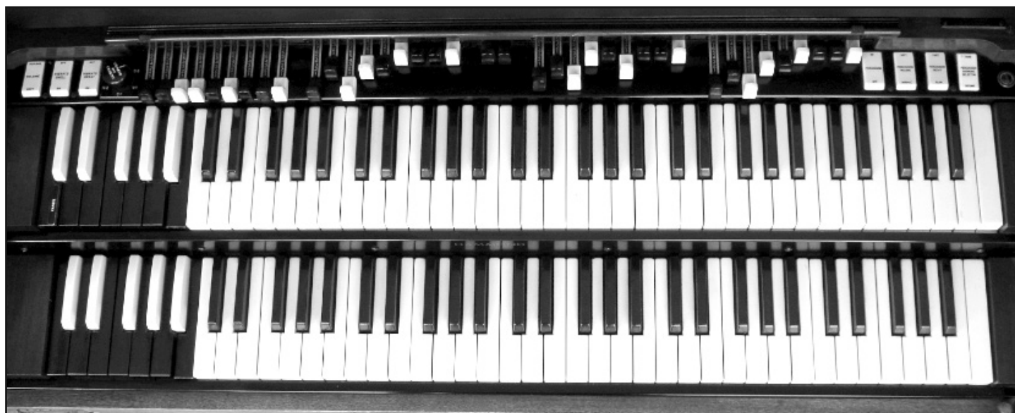
Hammond B-3 keyboard, drawbars, and switches.

I take the organ signal direct via a guitar jack socket out. To fatten up the signal, I route it through an Aphex 207 preamp, then into my Allen & Heath MixWizard mixer. I have two effects plugged into the mixer: a Lexicon LXP1 reverb unit set to a medium hall reverb, and a SansAmp pedal for overdrive. I can dial in the settings I want on each composition. The signal then goes into a Mackie 1,200-watt stereo amp, which routes it to two JBL MPro speakers with a 15-inch speaker and a 2-inch horn in each cabinet. My piano, the beautiful Korg M3 88-note stereo weighted-action keyboard, sits atop the Hammond. I also use a Korg X5DR half rack module MIDI'd to the piano to give me strings and other electric pianos that I can combine with some of the M3 sounds.