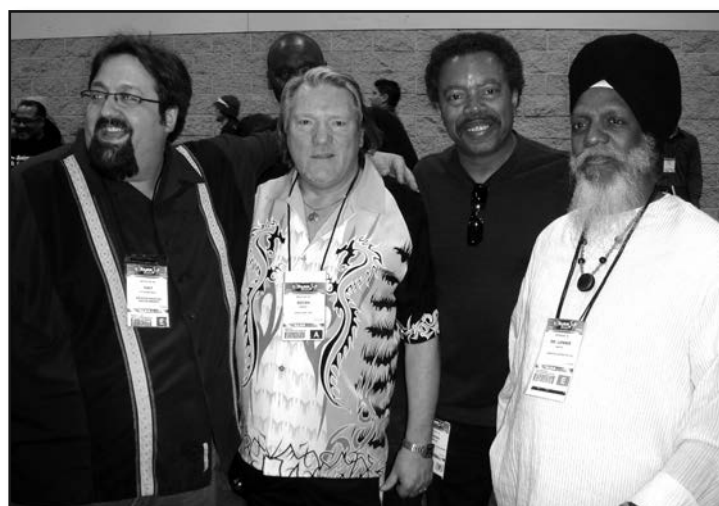
Joey DeFrancesco, Brian Auger, Chester Thompson, and Dr. Lonnie Smith.