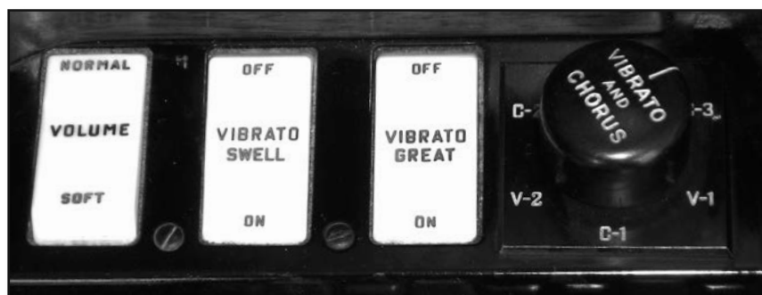
The vibrato/chorus knob; volume and vibrato switches.