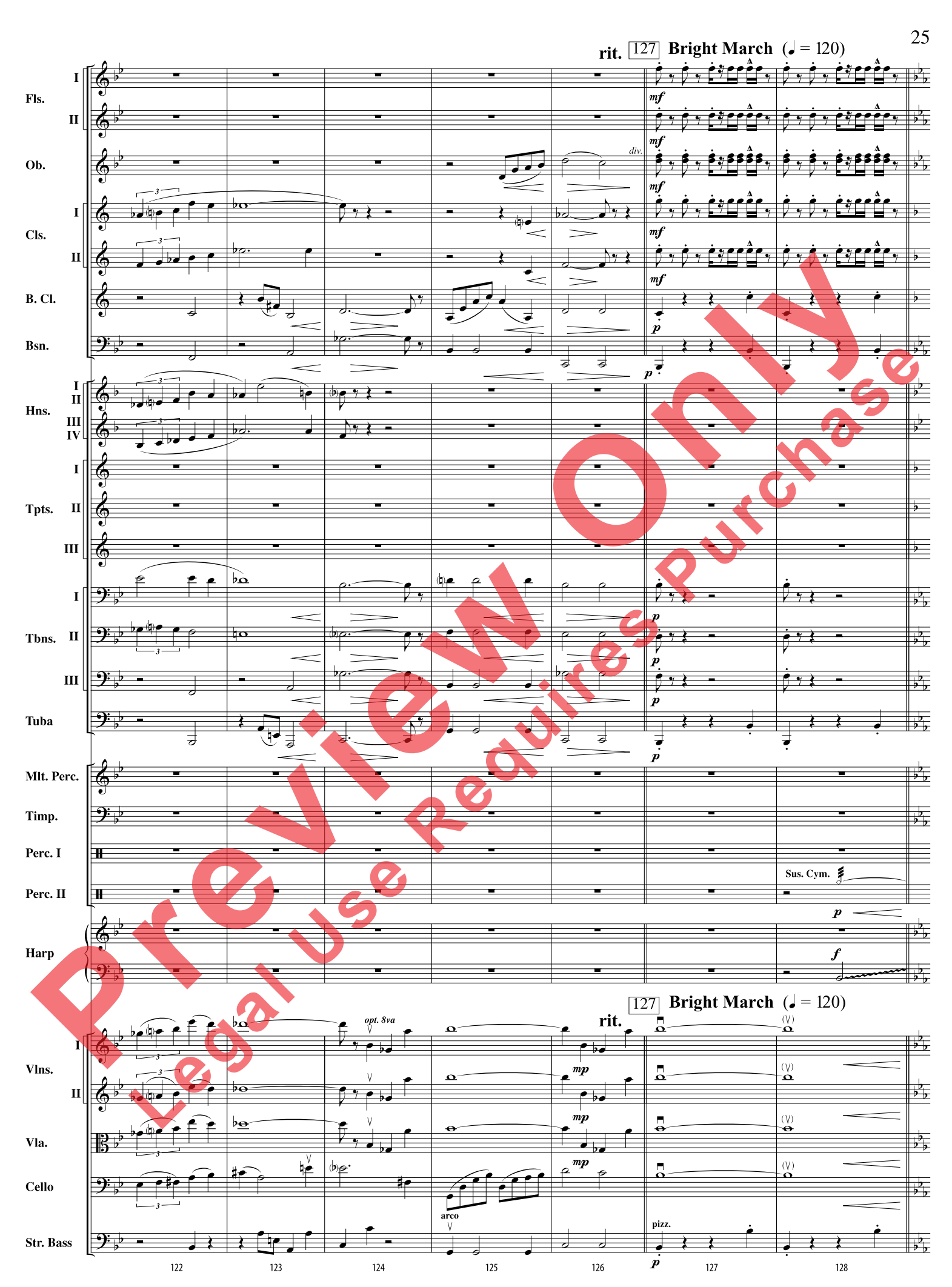
© 1981, 1984 BANTHA MUSIC (BMI) All Rights Administered by WARNER-TAMERLANE PUBLISHING CORP. (BMI) This Arrangement © 2008 BANTHA MUSIC (BMI) All Rights Reserved including Public Performance