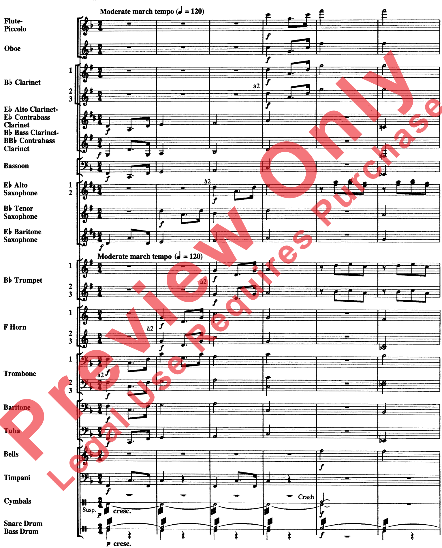
© 1997 Frank Erickson Publications All Rights Assigned to and Controlled by ALFRED PUBLISHING CO., INC. All Rights Reserved