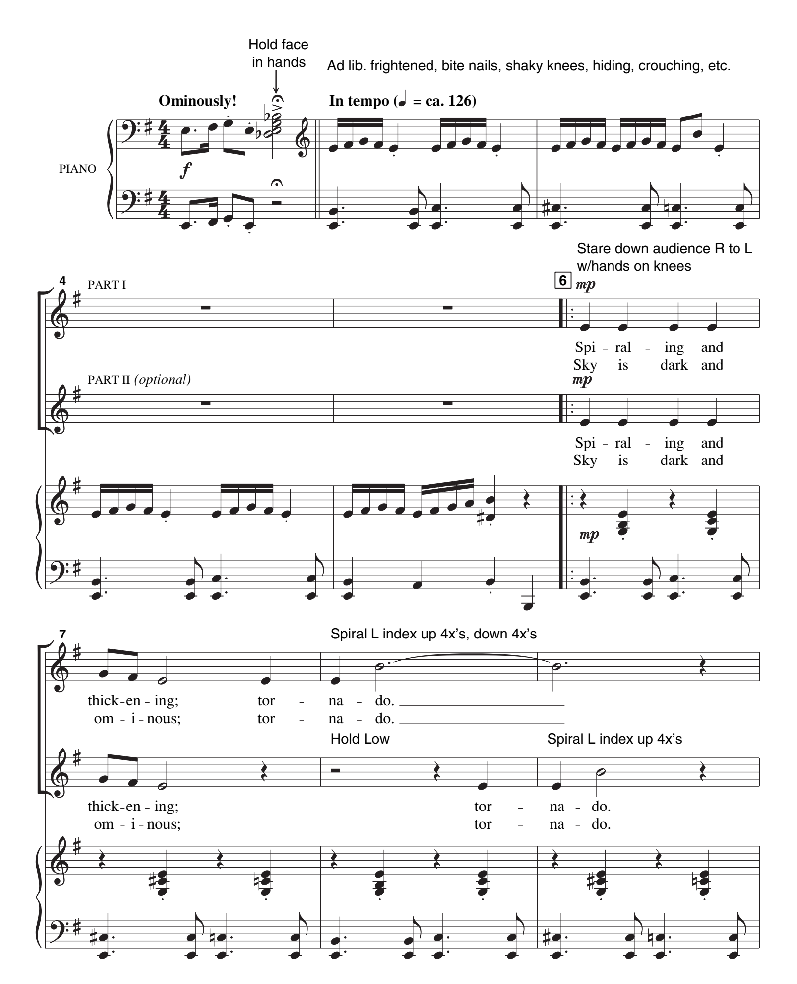
Copyright © MMV by Alfred Publishing Co., Inc. All Rights Reserved. Printed in USA.