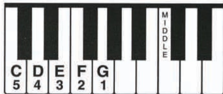
LH C POSITION