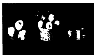
Cover art: Still Life with Lemons, Oranges and a Rose by Francisco de Zurbarán (Spanish, 1598–1664). Oil on canvas, 1633. The Norton Simon Foundation, Pasadena, California

We hope that these long-lasting, convenient bindings will encourage additional use of our publications and will continue to bring added pleasure to you for years to come.