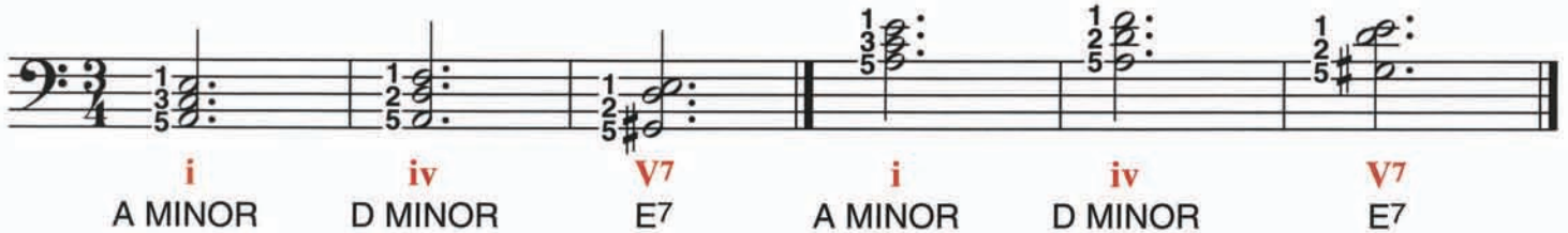
i A MINOR