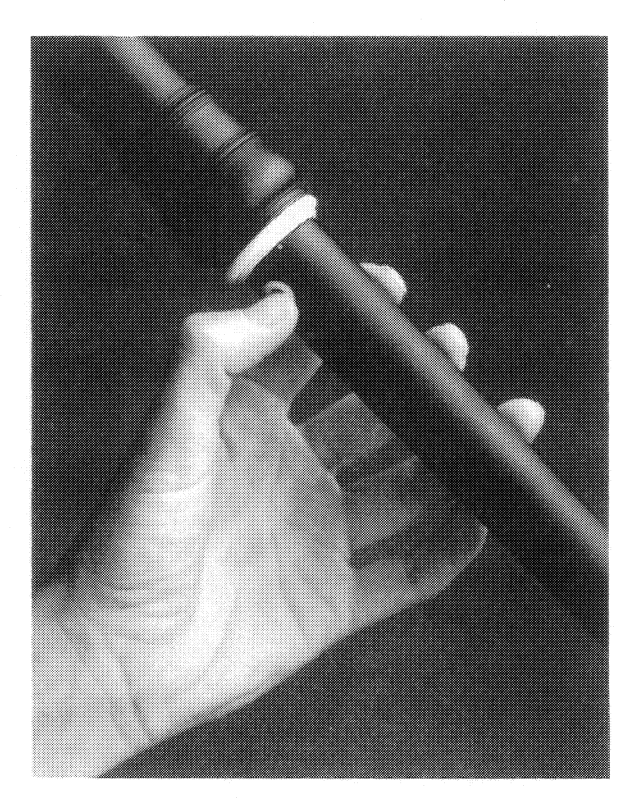
When we "half-hole" we maintain light contact with the thumb-hole perimeter. The size of the thumb hole opening (aperture) usually varies. In this case the thumb covers less of the thumb hole.